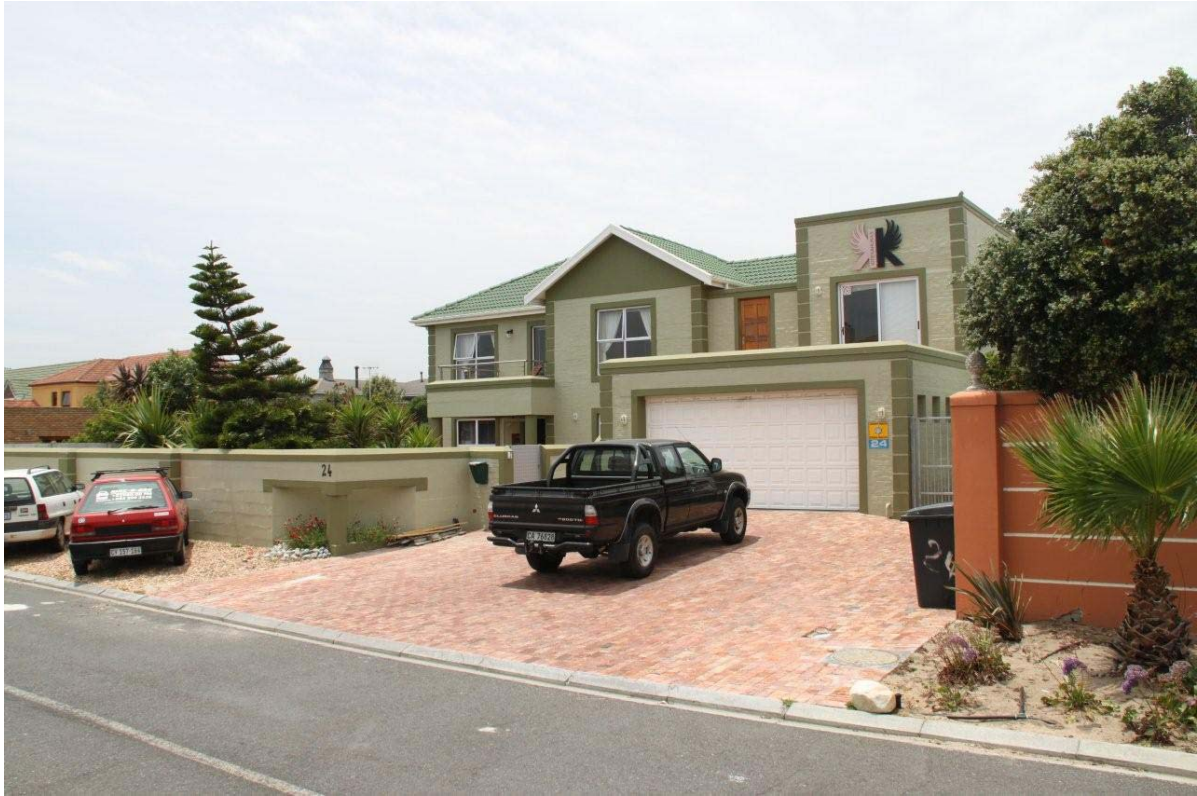
The Beach House of Kitekahunas, located directly on Sunset Beach, Cape Town.