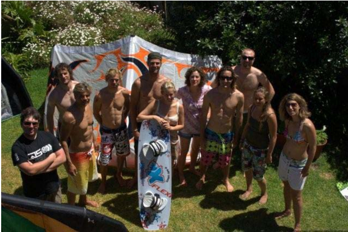
Kitekahunas Team with course participants kitesurfing in Cape Town , South Africa.