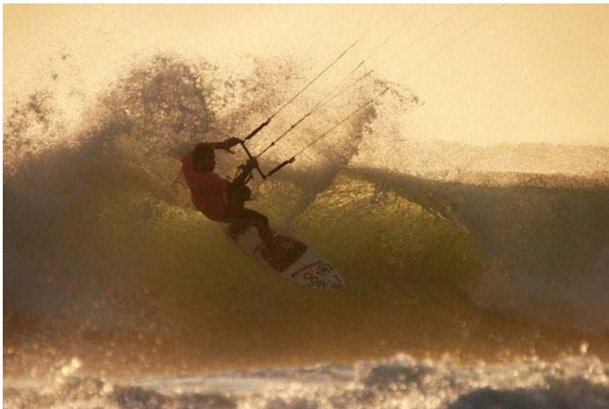
Kitesurfer in Cape Town.